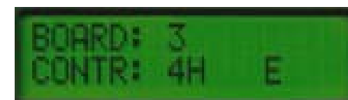
'Pro' - Actual size